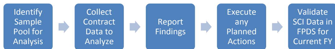
Figure 1: Analysis Process

To ensure the Department sufficiently addressed the service contract inventory requirements and developed a meaningful Analysis Report, a working group was utilized consisting of representatives from each of DOC's five contracting offices. As a result of the collaborative effort of the working group, a repeatable process, as depicted in Figure 1, was established to comply with the annual service contract inventory requirements.